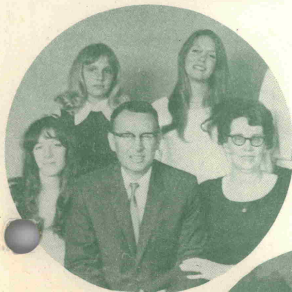
AND THEN THERE WERE FIVE AND THE CATS